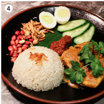
Images: 1. Chicken katsu curry 2. Skewer platter 3. Miso aubergine 4. Nasi Lemak